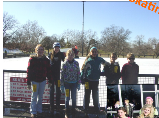
Ice Skating at Steinberg Rink