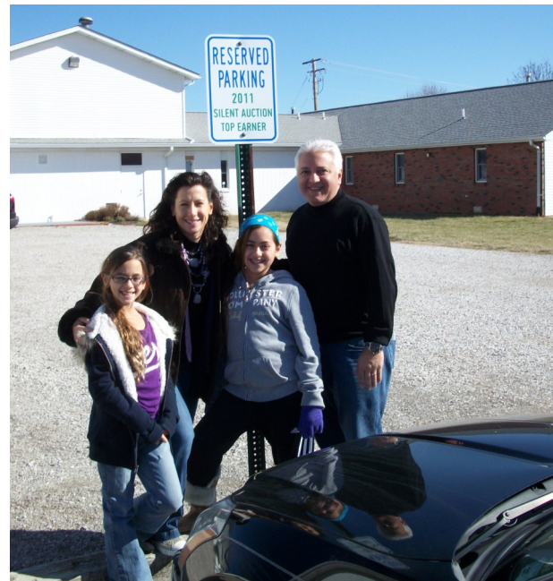
Congratulations to the Vitale family -- #1 fund raisers for Imagine No Malaria!